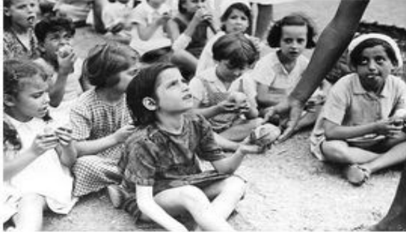
During World War II, parts of St. Peter's Oratory, one of the K of C playgrounds in Rome, served as the headquarters for the Vatican's food distribution program for the Roman people.

By the time Pearl Harbor was attacked and the United States entered World War II in 1941, a K of C welfare program for servicemen had been well established by Canadian Knights, built and modeled on the Knights' World War I work. In the United States, the Order's outreach to soldiers was conducted through the National Catholic Community Service organization, which itself modeled many of its programs on the Knights' war efforts.